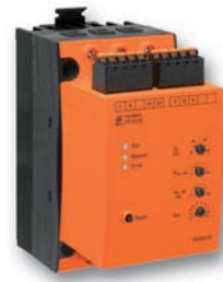
Softstarter PF 9015

The softstarter PF 9015 is suitable for applications requiring reduced starting torques. For example, for driving conveyor belts, compressors, grinding machines and many more. The device ensures a smooth, gentle start-up so that drive elements are not damaged. After start-up, the power semiconductors are bypassed by relays to minimize power dissipation in the device.